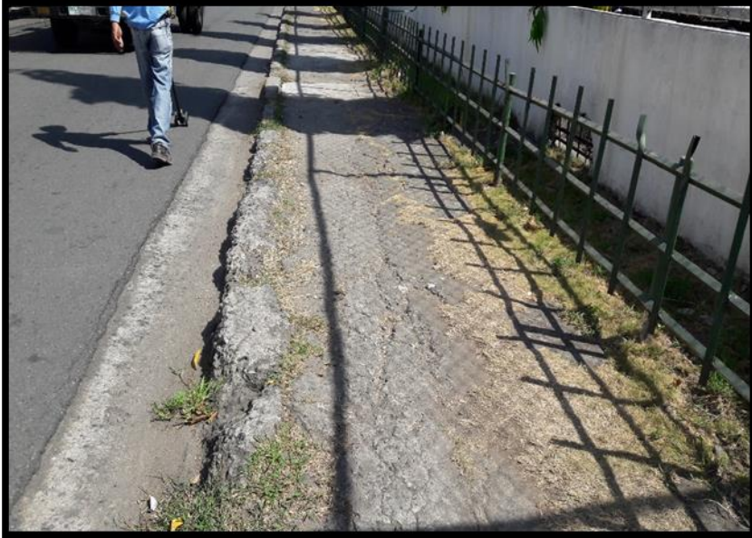
DAMAGED SIDEWALK ALONG ROAD D AND NORTH